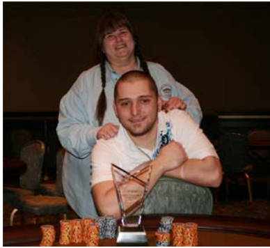
First & Second!!

Tournament Entries: 179 Prize Pool: $92,024 Cumulative Entries: 2699 Cumulative Pool: $1,023,515