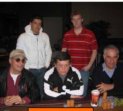
The Top Five!

Reported by Rhue R Reis for Foxwoods Resort Casino