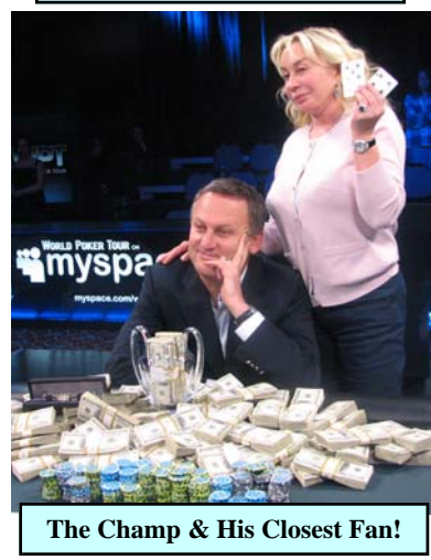
The Champ & His Closest Fan!