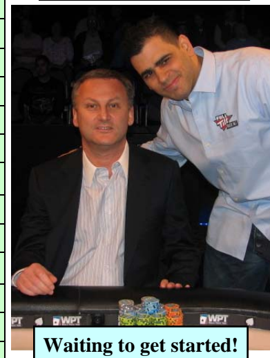
Waiting to get started!