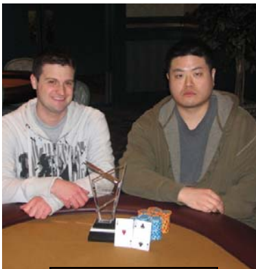
The Final Two!