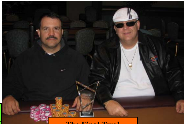
The Final Two!