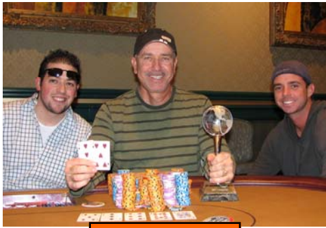
The Top Three!!