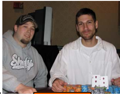
The Top Two!