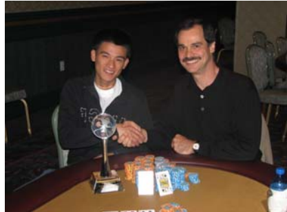
The Final Two!